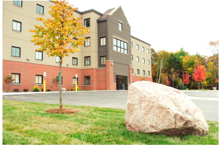
Pictured above is the New Dormitory, Ideal for adjusting to University life along side other students.