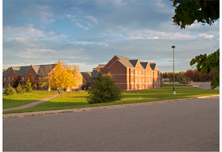
Pictured above is the Lou Lukenda Dormitory, for Canadian and International Students. Where you can embrace the diversity of this building.