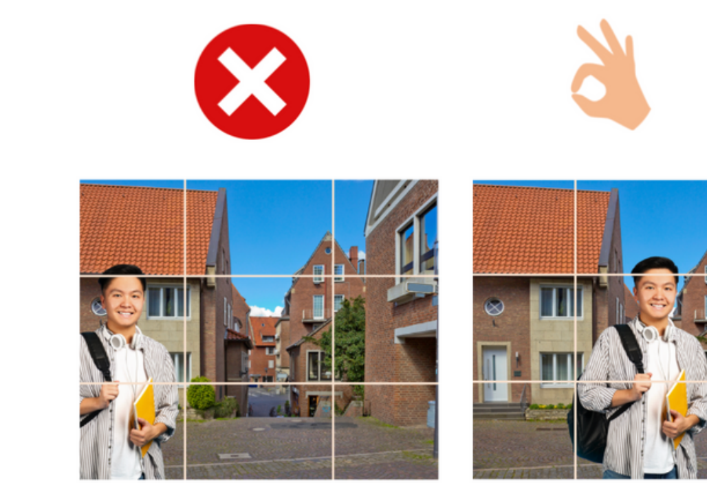
Not good. Body is cropped.

Turn on the camera grid view on your mobile phone! Watch the tutorial here: <u>Android</u> | <u>iPhone</u>